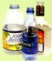
Plastic bottles (necks smaller than base)