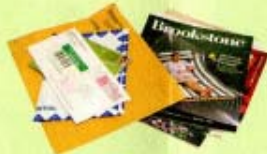
Mail, magazines, mixed paper and catalogs