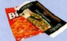
Frozen food bags