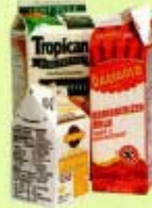
Paper milk-style cartons