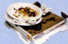
Food-contaminated paper plates and napkins