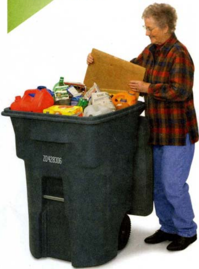
Grays Harbor County's New Curbside Recycling Program