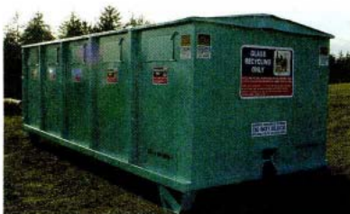
Glass drop-off sites are conveniently located throughout Grays Harbor County.

You also can continue to take recyclable glass to the LeMay transfer station and the existing multi-material drop-off sites sponsored by cities or hauling companies.