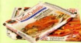
Paper or frozen food boxes