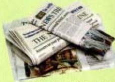
Newspaper & inserts