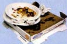
Food-contaminated paper plates and napkins